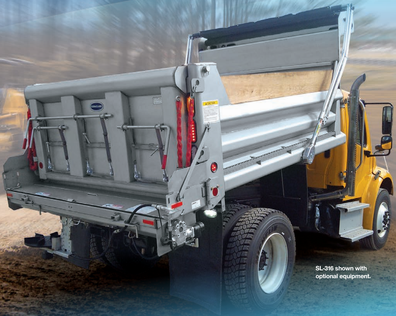
SL-316 shown with optional equipment.