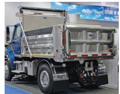
Premium Steel Construction- Minimum 45,000 psi. Additional steel and stainless steel options available.