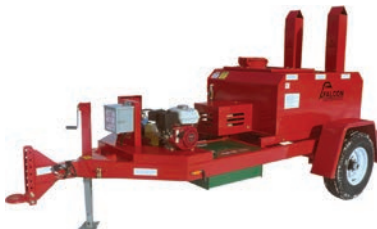
TACK TANK TRAILER