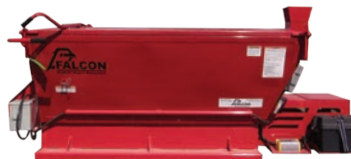
SLIP IN MODEL