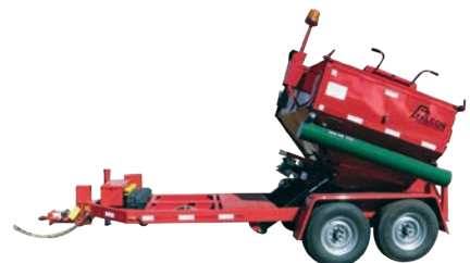
ASPHALT HOT BOX AND RECYCLER

Falcon Asphalt Repair Equipment 2000 Austin Street Midland, MI 48642 sales@falconrme.com