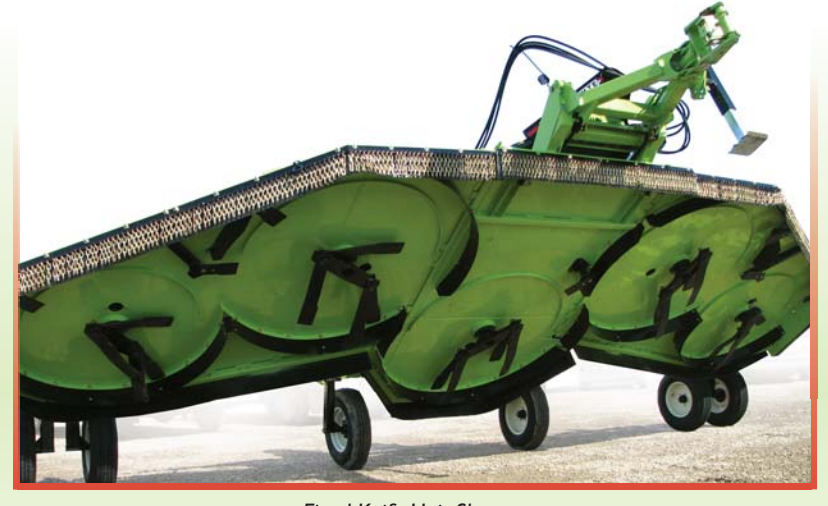
- Fixed Knife Unit Shown -