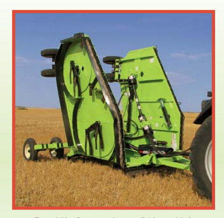
- Fixed Knife unit shown (Wings Up) -