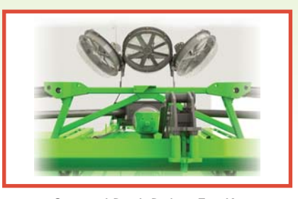
- Optional Deck Debris Fan Kit -