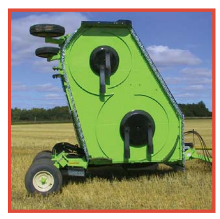
- Stump jumper unit shown (Wings Up) -