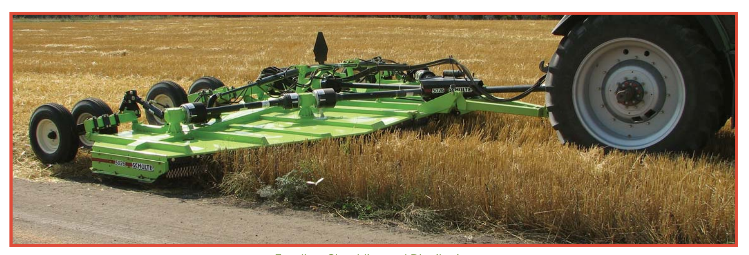
Excellent Shredding and Distribution