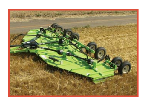
- Shredding Wheat Straw -