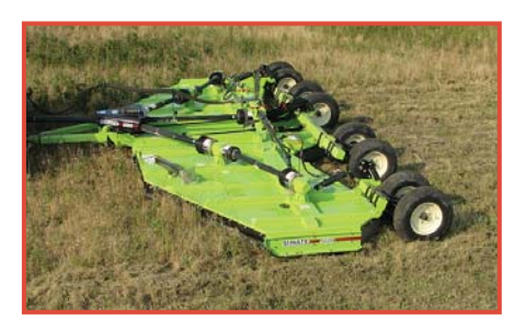
Pasture & CRP Maintenance