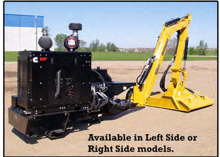
Available in Left Side or Right Side models.