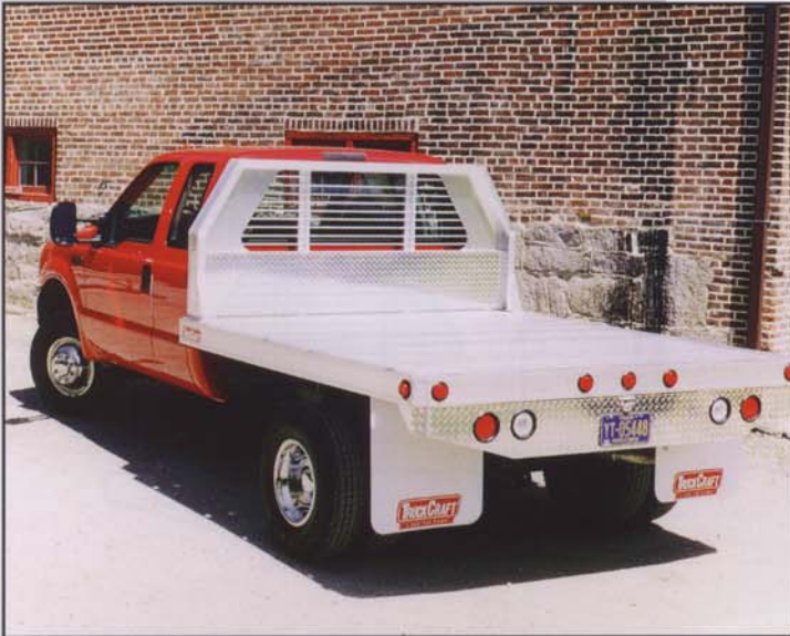
Model 94x9 with optional Cab Guard & Tailboard

*NOTE: Your truck, dumper & payload should not exceed the G.V.W. rating or axle rating usually found on the inside of the doorframe on the driver's side.