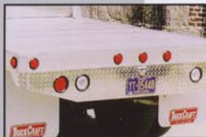
TAILBOARD 10" high, bright diamond plate with wrap around corners. Includes license plate light, 4 1/2" stop, tail, turn and backup lights.