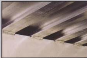
FLOOR CONSTRUCTION Plank extrusions provide rigid reinforcement every 5".