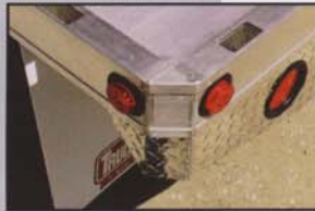
RUB RAIL 5 1/2" custom shaped rub rail with mitered corners & stake pockets cut into the top.