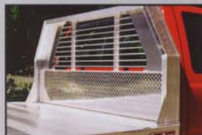
CAB GUARD Profile shape with protected window area. 5 1/2" frame matches rub rail appearance. Bulkhead of 1/8" bright diamond plate.