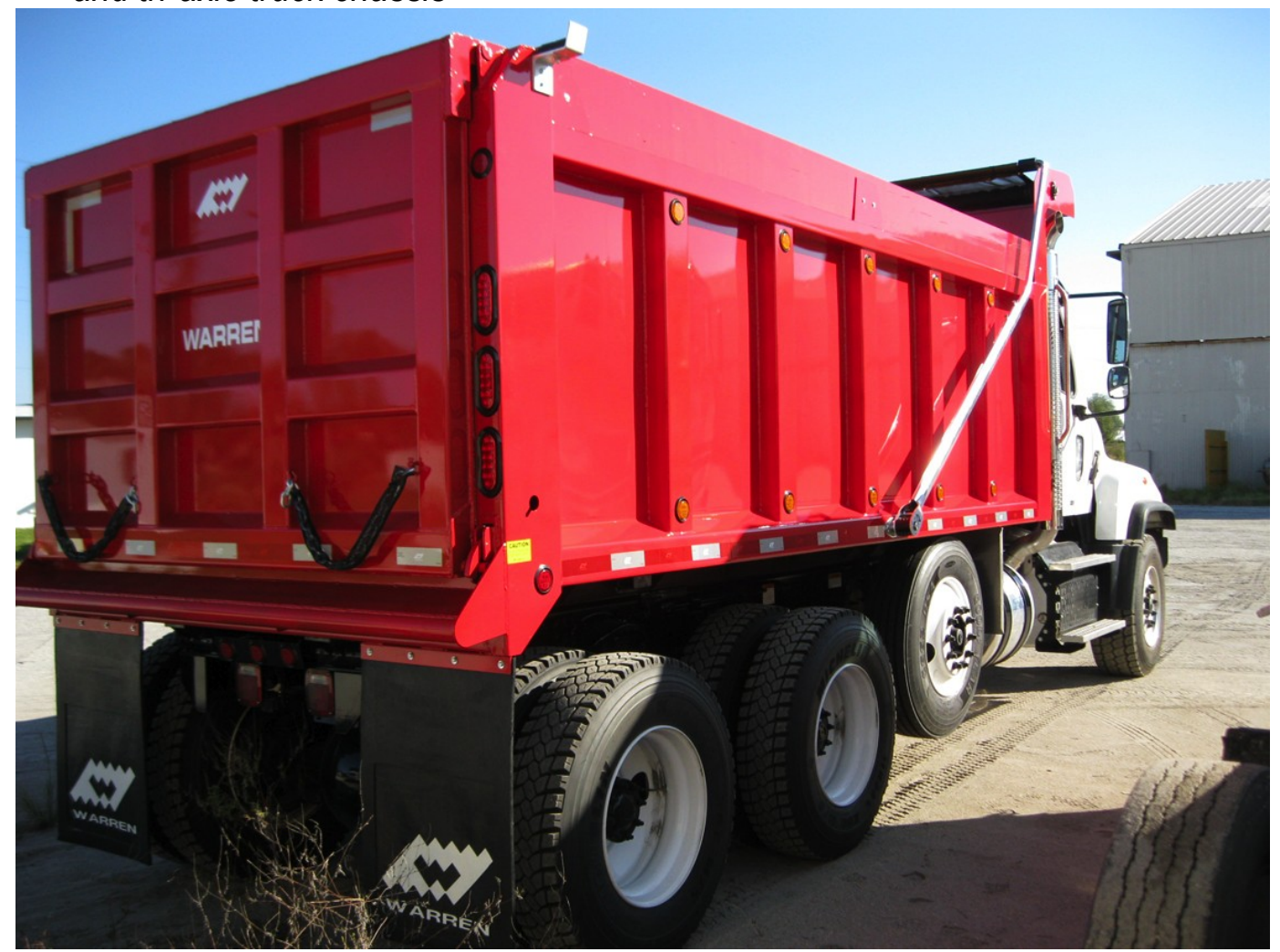
Features & Benefits of Warren FL Bodies

Warren FL Series dump bodies are designed for mounting on heavy duty tandem and tri-axle truck chassis