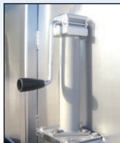
Manual chute control