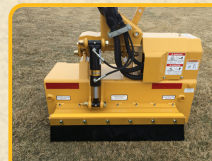
REAR RUBBER FLAP OR REAR CHAIN GUARD