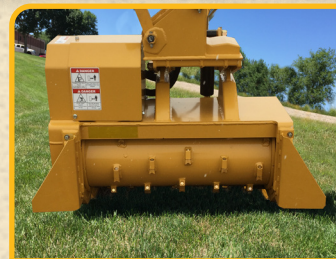
FRONT VIEW OF MULCHING HEAD