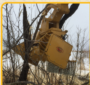
HYDRAULIC DRIVEN HEAD TILT