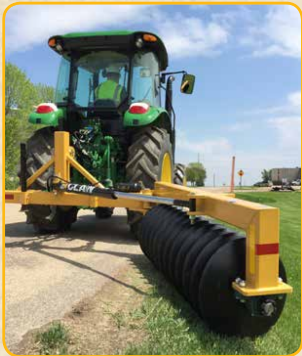
Patented angle design effectively moves and mulches 37" of material.

*U.S. PATENT NO'S 5,108,227 & Re. 34,860 CDN PATENT NO. 2,029,695