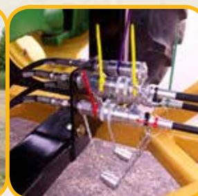
Plug & Play Bulkhead for quick disconnect