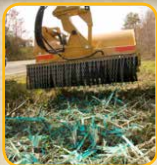
Spray Chamber attaches to Boom Flail Cutter Head.