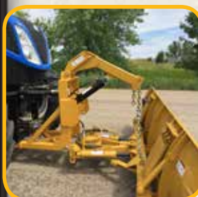
Front Snow Plow

For additional features and specifications, please contact your Tiger Dealer.