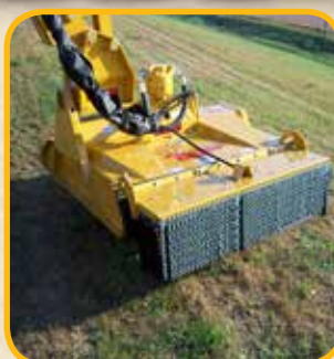
Spray Chamber can also attach to boom Rotary cutter head.