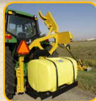
50, 100 & 150 gallon Tank mix systems are available for the tractor 3 PT hitch.

With a single flip of a switch, the WetCut Computer controlled system accurately applies the target rate. The digital display keeps the operator informed on the vehicle speed, system pressure and the GPA (gallons per acre) being applied.