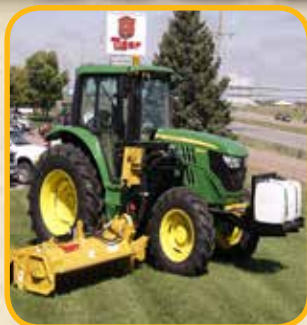
Offset Sprayer can reach weeds up to 14 feet from the right of the mower deck.