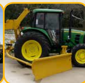
Side Patrol Wing